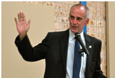
Making a point at the public meeting

I was pleased to report on my participation in the committee and the progress we are making.