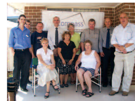
With new residents and staff of Compass Housing.

This is a good news story – one that shows that social housing can be embraced by existing communities when they are properly considered.